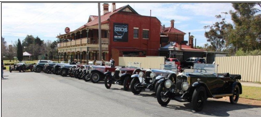
Vauxhalls ready to leave Coolamon