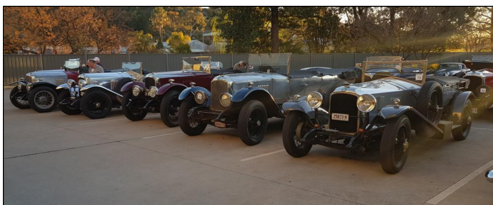
Vauxhalls at the motel in Wagga