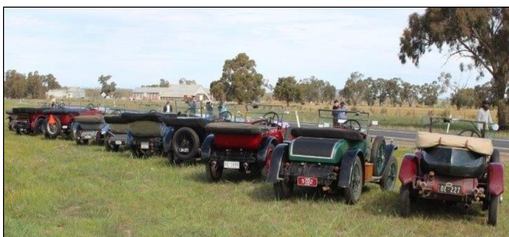
Vauxhalls on a road near Coolamon