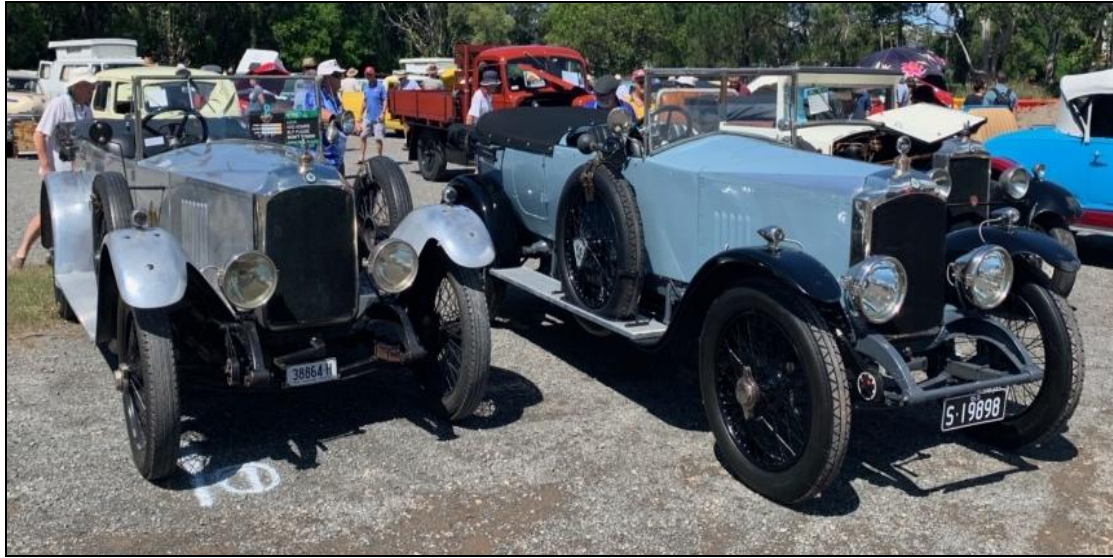
OD30 and D2908